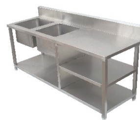
Work Table With Single 2 Sink