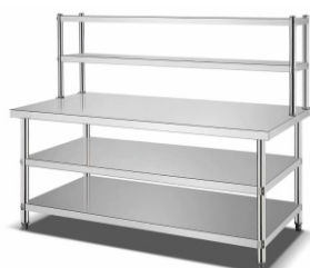
Work Table With 2 U/S & 2/OHS