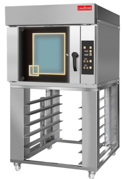
Rotary Rack Oven