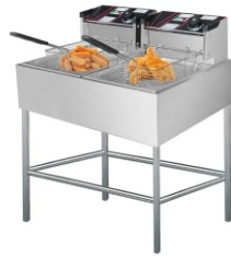
Deep Fat Fryer