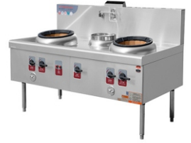
Wok Chinese Gas Range