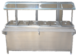
Hot Bain Marie