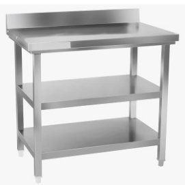
Work Table With 2 U/S