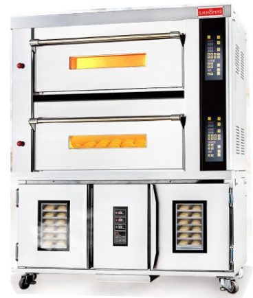
Deck Oven With Proofer