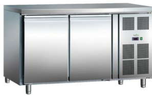
2 Dr Undercounter Refrigerator