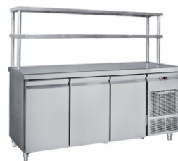
3 Dr Undercounter Refrigerator