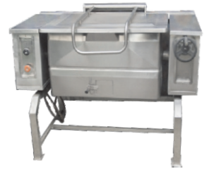
Titling Bratt Pan