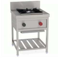
Single Burner Gas Range