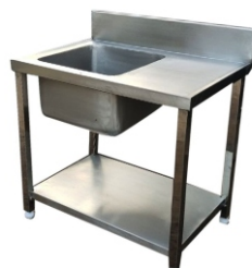
Work Table With Single Sink