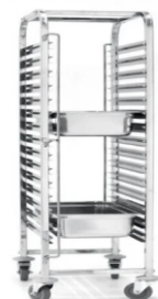
GN Pan Trolley