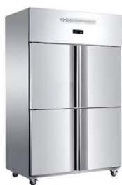
Four Door Refrigerator