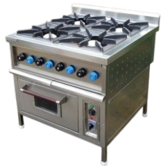
Four Burner Gas Range