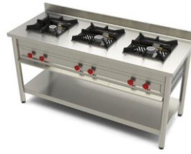
Three Burner Gas Range