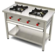
Two Burner Gas Range