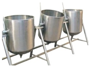
Steam Cooking Plant