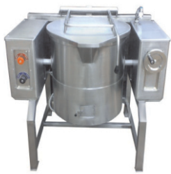
Tilting Boiling Pan