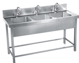
3 Sink Unit