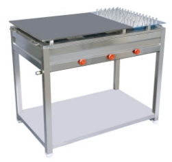
Chapati Plate With Puffer